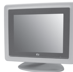
▲ Desktop stand