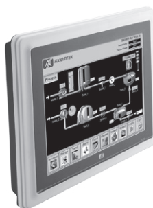
▲ Side view